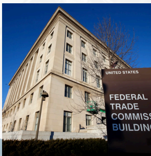
Commission building is seen in Washington on Jan. 28, 2015.